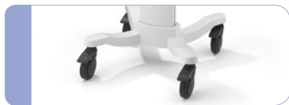
Model shown here with hospital-grade wheel option Part #105342

The CP 150 has multiple USB ports and ethernet connectivity to enable you to easily transfer ECG test data to your EMR