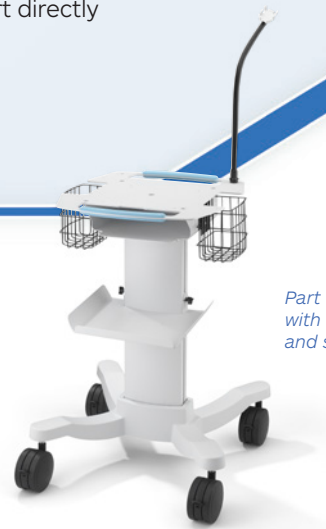
Part #105341 with optional cable arm and shelf (part # 105343)