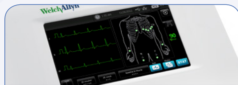
LEAD QUALITY DISPLAY

No need to track between the display and keyboard, helping you to save time and reduce errors.